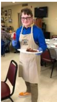
Youth assisting at Ash Wednesday Pancake Feast

Adventure -Coming up the first weekend in May– rafting the Nolichucky River. On Saturday, May 4, we'll leave from the upper parking lot at 7:00 a.m. and should be back by 5:00 p.m. The cost is $80, and includes lunch. Friends are welcome and confidential scholarships are available if cost is an issue.